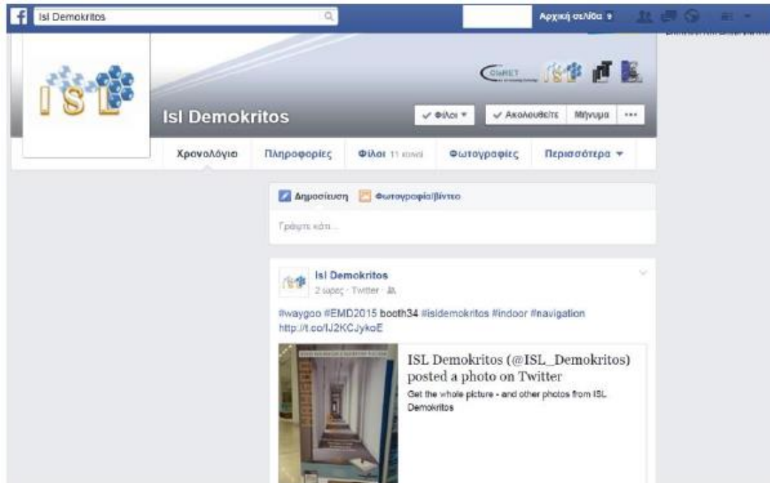
FIGURE 3 - SOCIAL MEDIA PRESENCE

Besides LinkedIn, social media presence will be established and maintained to other popular platforms such as Twitter and Facebook, aiming to promote visibility of FLYSEC public events and information. Besides creating FLYSEC dedicated groups and social media pages, partners will be encouraged to promote FLYSEC and create postings frequently in their own pages and social networks. A first objective of the FLYSEC social media campaign would be to establish visibility and awareness for the www.fly-sec.eu domain and website.