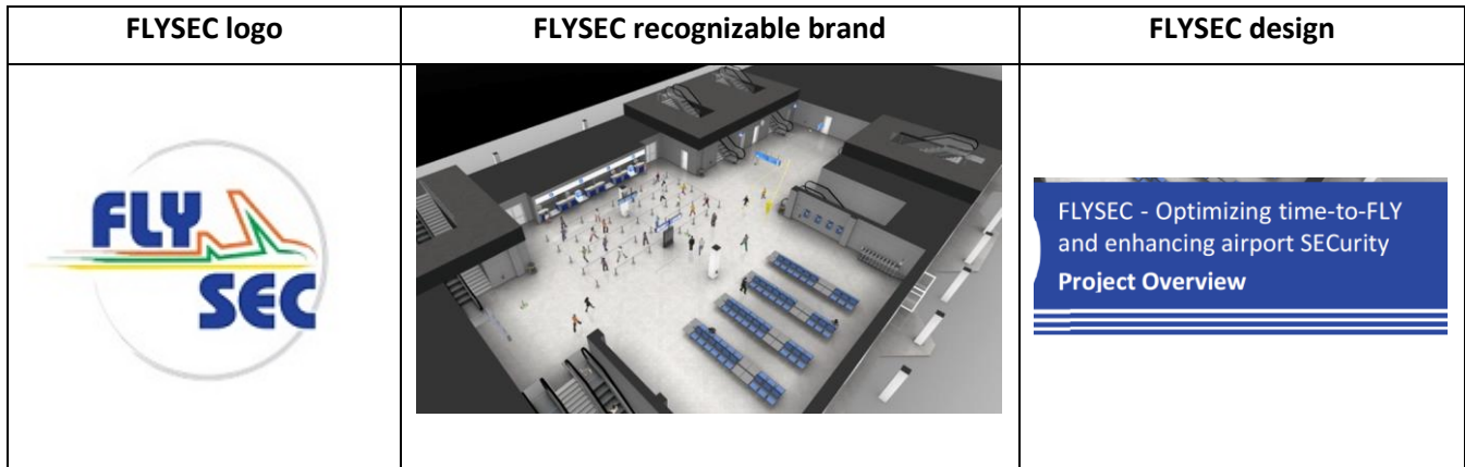
TABLE 8 - FLYSEC CORPORATE IDENTITY

A corporate identity is being developed to give FLYSEC a recognizable brand that will be used across all project communications. It includes a project logo, graphic charter, and colour definition, dedicated templates for PowerPoint and word usage.